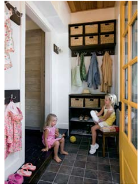
THE NEW MUDROOM is a catchall for shoes, hats, and sandy tots.

responsibly harvested white oak stained with a milky low-VOC coating, Terhune hand-milled the individual boards and treated them with a wire brush to mimic the natural gradation of wood tumbled by the sea.